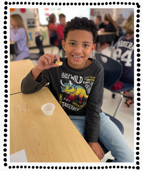
Live Better hosted a Superfood Try-Day at Cross Creek on Friday February 23rd. Students had the opportunity to taste broccoli-cheddar biscuits!